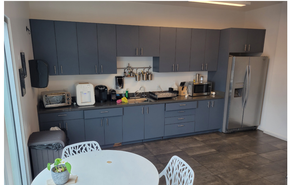
Unit B - 2nd Flr.